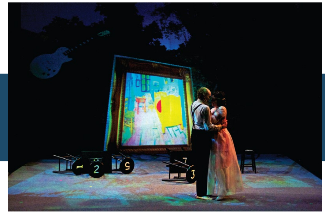
Figure 6. Zero and Daisy dancing in the Elysium Fields. Note the animation of artwork projected from the front that matches the scenic elements in the background.

In terms of stage illumination, front projections functioned as front lights almost throughout the entire performance. In a few cases the projectors supplied a simple color