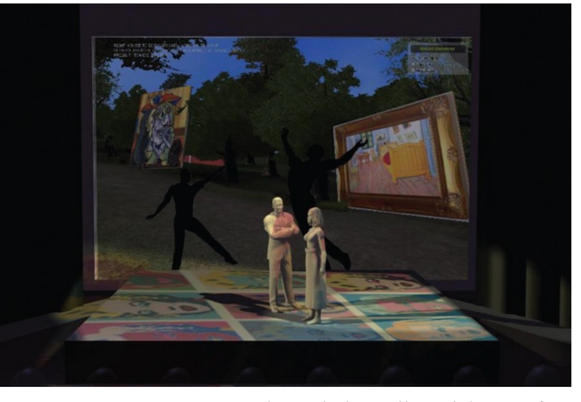
Figure 5. Zero and Daisy in the Elysium Fields. Note the live images of the chorus inserted into the scene. Also note the video footage of sunlight through trees most evident of the stage floor.

Figure 4. A conceptual sketch for the "Elysian Fields" Virtual reality technology is used to plan the production as well as execute the CGI scenography.