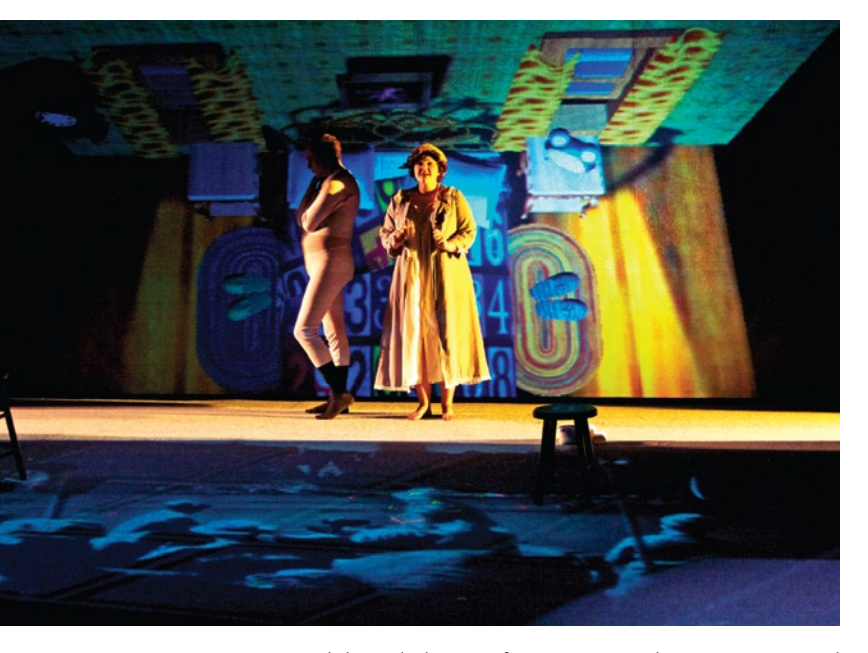
Figure 2. Mr. and Mrs. Zero at home in bed. Note the unique camera angle in the VR simulation that places them "lying down" while standing. Also note the silent movie footage visible on the stage floor.